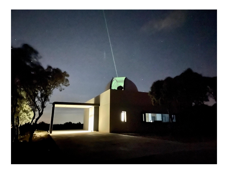
Figure 4: Yebes YLARA Satellite Laser Ranging station

Recently, the Yebes Observatory has also acquired another space geodetic technique, a Satellite Laser Ranging station, which saw first light in May 2023 (Figure 4). The station has a 70m diameter telescope with a laser package installed in piggy-back configuration for SLR observations, and another laser in Coudé focus for space debris studies.