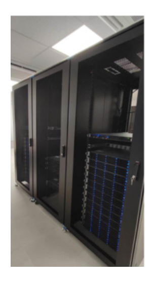
Figure 3: Cabinets with the RAEGE correlator equipment

Recently, the Yebes Observatory has also acquired another space geodetic technique, a Satellite Laser Ranging station, which saw first light in May 2023 (Figure 4). The station has a 70m diameter telescope with a laser package installed in piggy-back configuration for SLR observations, and another laser in Coudé focus for space debris studies.