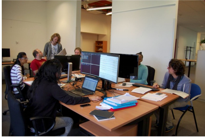
JIVE support scientists at work