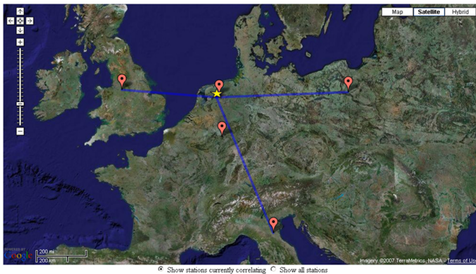
Figure: Correlation display, "Currently correlating" display

The second display is a list of all of the telescope sites that could send data to JIVE for correlation. This display includes both astrometric and geodetic telescopes, of which a subset has sent data to JIVE.