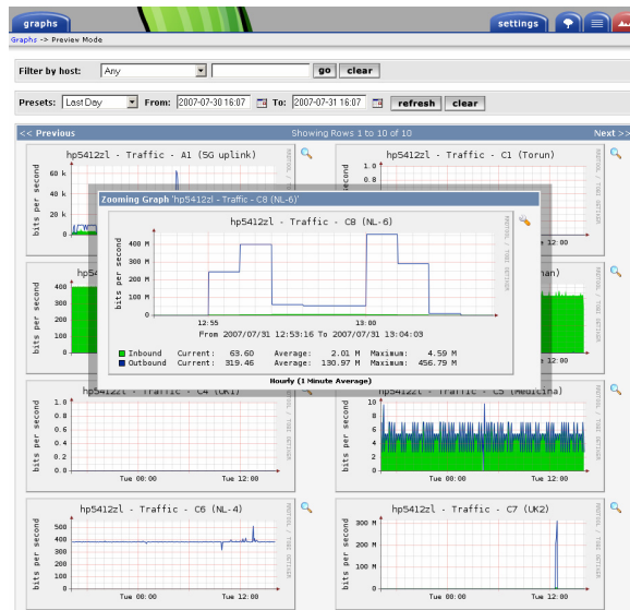
Figure: Cacti output displaying network utilization on one of the links into JIVE

This data forms the foundation for a larger network monitoring scheme that will allow e-VLBI operators to track the status of the network and respond to problems as they evolve. The next steps