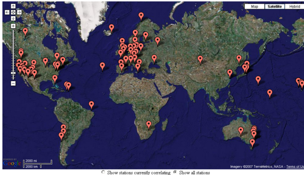
Figure: Correlation display, all telescope sites