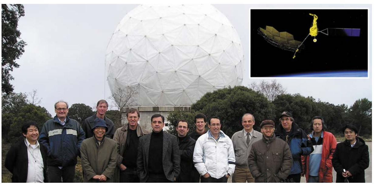
Pictures: Photo group of the participants in the VSOP-2 tracking-station meeting at Yebes. The 14-m antenna could be used for tracking, while the new 40-m radiotelescope will participate in the ground network.

A meeting was held at the headquarters of the National Astronomical Observatory (OAN) of Spain in Madrid, and the Yebes Astronomical Center (CAY) on February 19-20 2007, where representatives of ISAS/JAXA, ESA, NASA, JIVE and OAN attended, focused on the planning of tracking stations for ASTRO-G. The satellite will link to Earth at frequencies around 40 GHz, so a possible tracking station segment would include the 10-m antenna at Usuda (Japan), 20-m at Green Bank (USA), and 14-m at Yebes.