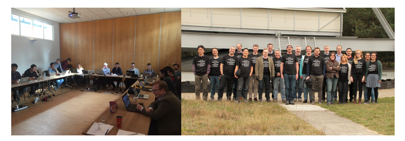
Figure 5. Participants in the CASA-VLBI workshop at JIVE, October 2-6, 2017.

van Bemmel has done a lot of work on verifying our code, both on real data and by doing simulations. She also was the main driver behind the first CASA VLBI workshop that JIVE organised during the first week of October, Fig. 5. During this workshop experts on VLBI, e-MERLIN and long-baseline LOFAR from all over the world spent a week working with a pre-release of our software on their own data. This helped a lot in identifying remaining bugs and missing functionality. The overall verdict seems to be that we are very close to having usable (but basic) VLBI support in CASA.