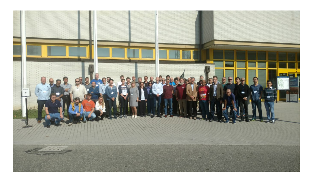
Figure 3. The sixth IVTW meeting in Bologna, October 9-11, 2017.

The sixth IVTW meeting took place in Bologna in October 2017 and gathered more than 65 people from many institutions involved in VLBI across the world, Fig. 3. The workshop was focused on developments at stations and correlators. The agenda of the meetings and presentations are available at the web page: <u>https://indico.ira.inaf.it/event/2/timetable/#20171009</u>